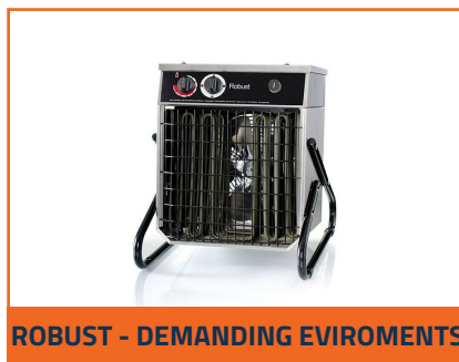
ROBUST - DEMANDING EVIROMENTS