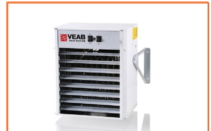
EA - WALL MOUNTED