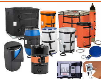
VARMEMÅTTER TROMLER / BC