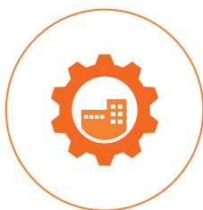
HVAC & BYGNINGS- AUTOMATIK