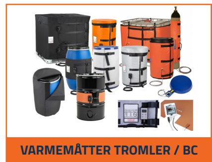
VARMEMÅTTER TROMLER / BC