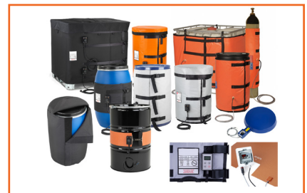
VARMEMÅTTER TROMLER / BC